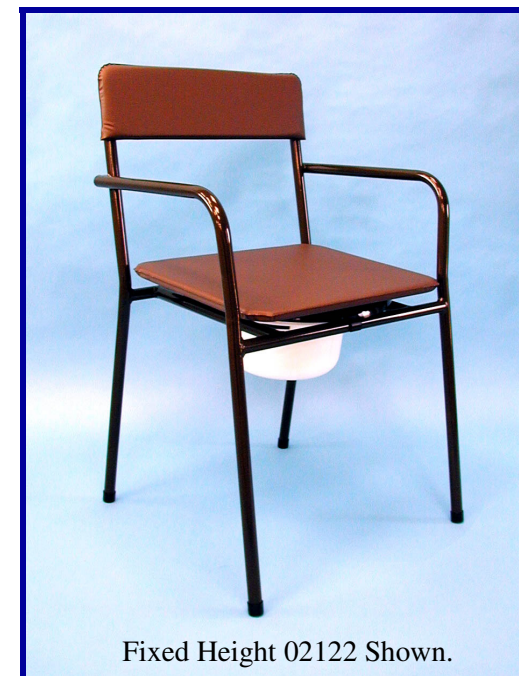
Fixed Height 02122 Shown.

On receipt of your new ASM Stackwell Commode please check for signs of damage, report any defects to ASM immediately. The ASM Stackwell Commode comes fully assembled and ready for use once the commode pot is fitted. To fit the commode pot and adjust the height please follow the instructions below: