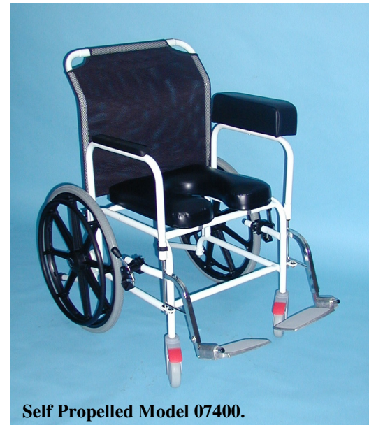
Self Propelled Model 07400.