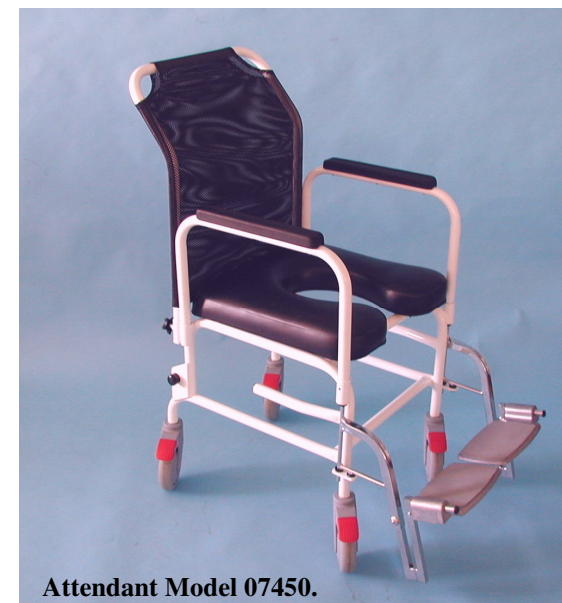
Attendant Model 07450.